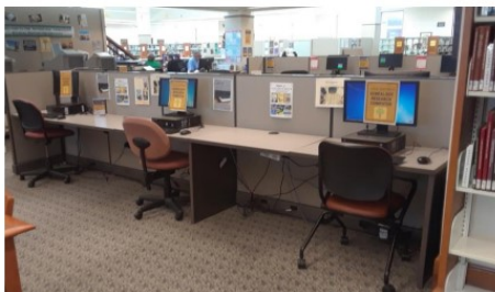
COMPUTERS FOR GENEALOGY USE ONLY