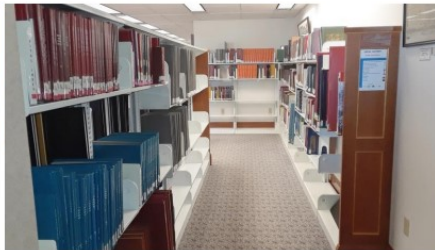
ARCHIVES AND DIGITIZING AREA