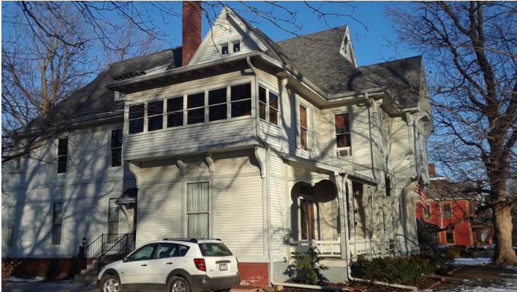
Dorothy Q Chapter DAR House