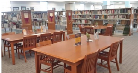
RESEARCH TABLE AREA