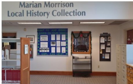
LOCAL HISTORY AREA -- Starting place