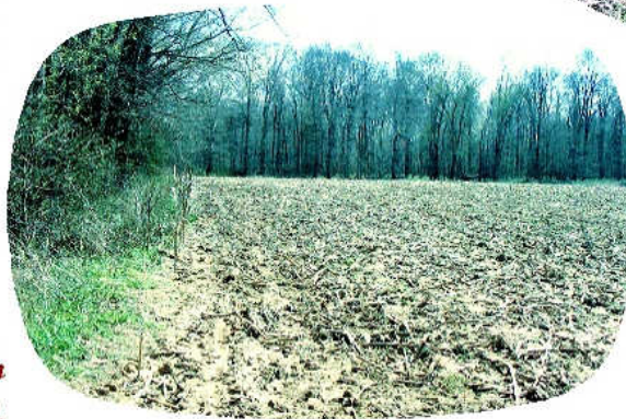
LEFT: Looking South from the field edge next to the stone, the tree line defines the county line and the North border of the Holland property. The distance is about 200 yards. NHW