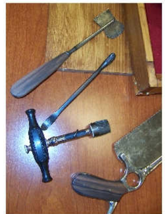
ABOVE : Surgical instruments from the kit at the left. Use unknown except for the saw.