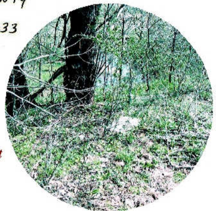
RIGHT: The stone fragment was found in the field margin at the bluff edge over Cornstalk Creek [about 12 feet down; blue patch just above the stone]