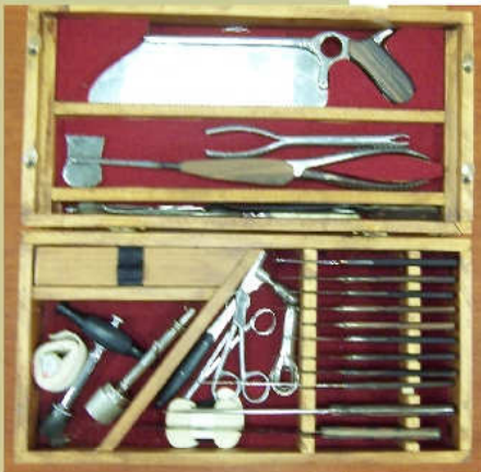
ABOVE : A typical Civil War military surgeon's field kit. The majority of these instruments are for cutting.