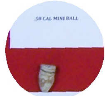
ABOVE : The famed "minie ball" is not a ball shape at all, and, in battle, could have been any of 13 of the other similar shape projectiles in the case at the left. Calibre [CAL] is gun talk for 'one hundredth of an inch maximum diameter', or, in this case, 0.58 inch diameter, same as the circle (hole in you?) at the left.